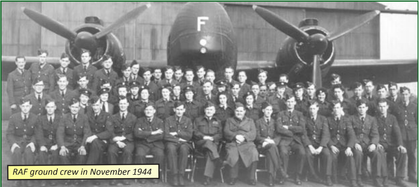
RAF ground crew in November 1944

The pandemic may have stopped a lot of clubs and groups across the parish from taking place, but Fradley Heritage Group has continued its valuable research on the history of the village.