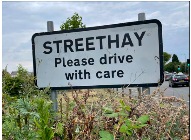
Fradley and Streethay could soon have separate councils.

In the next four years, the population of both wards combined (aged 19+) is set