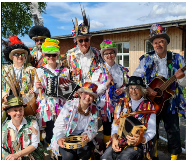
The Ryknild Rabble morris dancers entertained visitors.

Anyone interested in getting involved in future Open Garden events can email: fradleyopengardens@btinternet.com