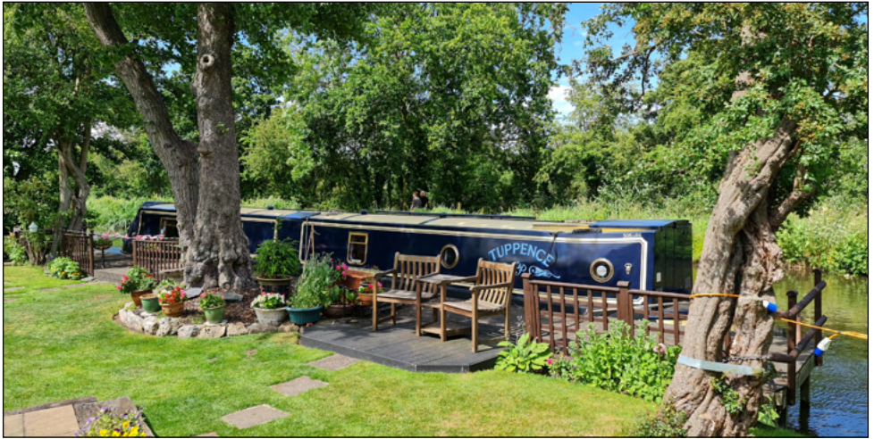
(Above, below and opposite bottom) beautiful gardens in bloom around Fradley.